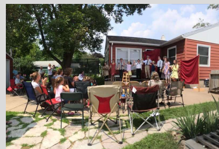
After the performance in 2013